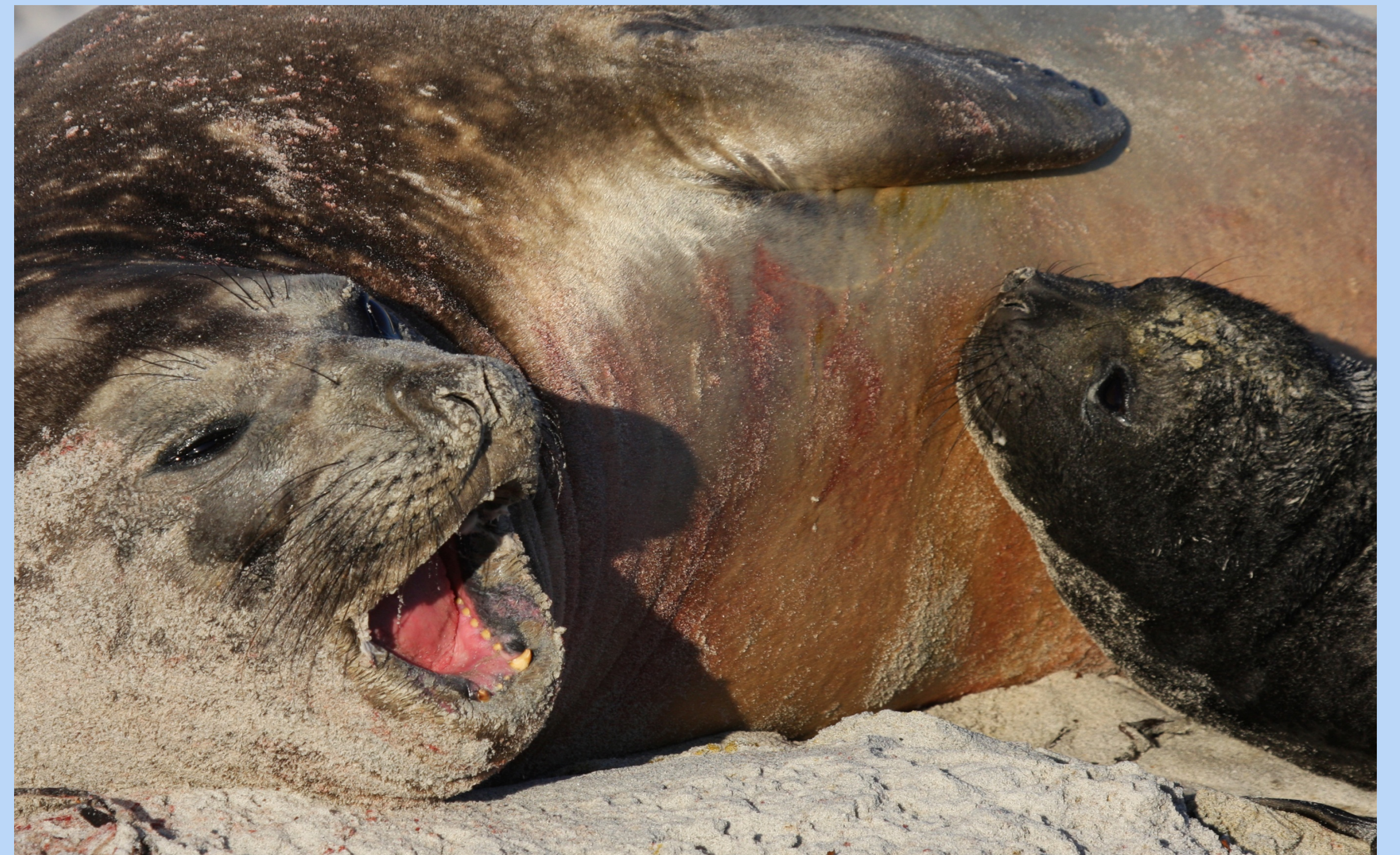
Fig. 1 – Vocal duet of SES mother and pup just after parturition

Pup vocalizations are a core component of the mother-pup recognition system in many species, and they have a great functional value because they permit the establishment of the mother-pup bond that is essential for pup survival. Southern elephant seals ( Mirounga leonina , SES) breed in dense aggregations called “harems” that may include up to hundreds of individuals and, therefore, present challenges for vocal recognition systems due to the abundant background “social” noise. Therefore we expect SES pups to have a rich communication system (Fig. 1), with large individual variation, that can permit an efficient recognition by the mothers, and the establishment of a stable bond during the suckling period.