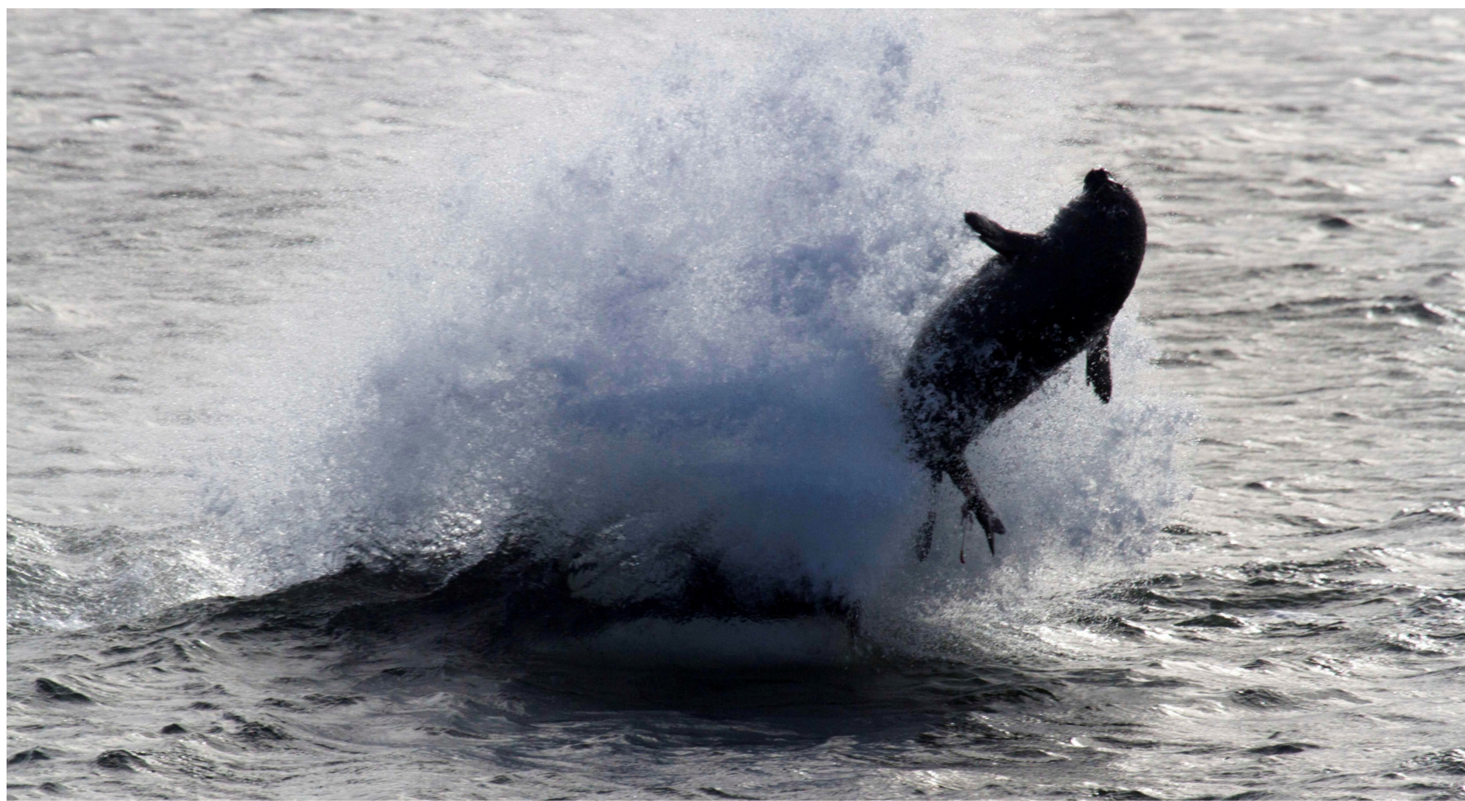
Fig. 1 – KW hunting on a weaned SES pup (head strike)

Killer whales ( Orcinus orca , KW) are apex predators with variable feeding strategies, peculiar diet specializations and complex hunting tactics involving the collaboration of various socially bonded individuals. Pinniped hunting by KW has been studied in various places of the Southern Hemisphere, but not in the Falklands, where anecdotal information suggest the presence of regular predation of southern elephant seals (SES; Fig. 1) and southern sea lions (SSL). We studied KW hunting strategies at Sea Lion Island (SLI), the main SES breeding site in the Falklands (pup production ~ 650), that also shelter a SSL breeding colony (pup production ~ 60).